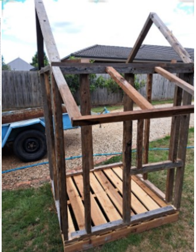
A couple of new buildings for the miniature trains all made from recycled materials.