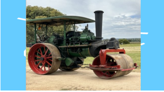
Some of the work to remove the 100 year old chimney base from the Fowler Roller