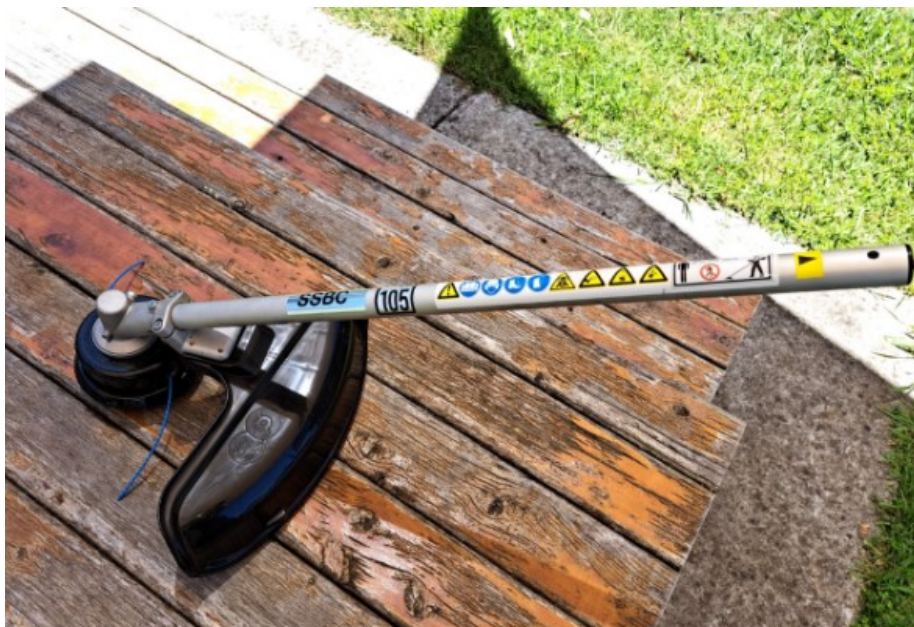
The new wiper-snipper head to replace the worn out one. Please look after it.